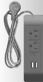
Easy Mounting With Keyhole